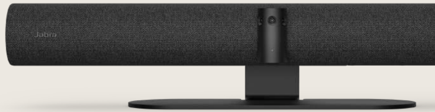
Table stand is sold separately as an optional accessory.

With an array of intelligent experiences, PanaCast 50 brings remote participants into the meeting room to make hybrid working work.